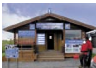
Icelandic Mountain Guides Sales Cabin in Skaftafell